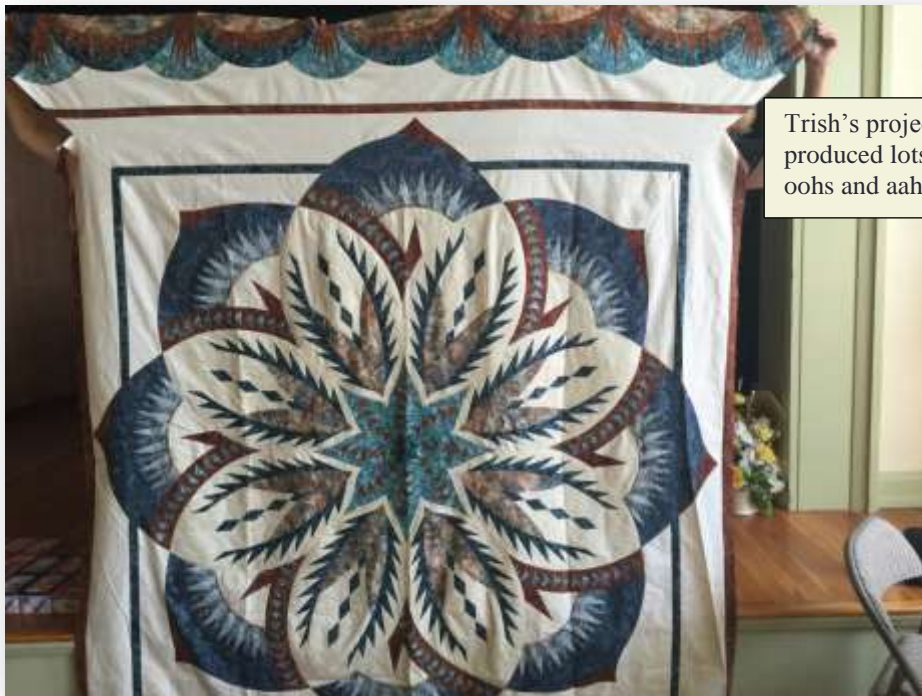
Trish's project produced lots of oohs and aahs!